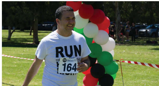
Run for Palestine is one of the many events organised by Afopa.

60 Frome St, Adelaide SA 5000 Monday, Wednesday, Friday – 9:30 am to 4.30 pm